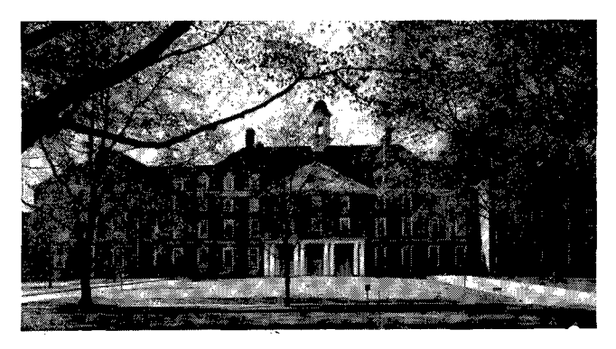
Illini Union Building